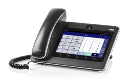
GT890: IP Desktop Video Telephone