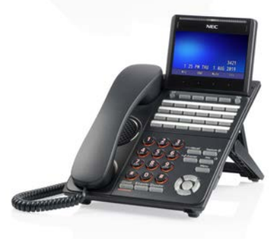
Color: Easy call control from the office, remote or home-based working, hot-desking