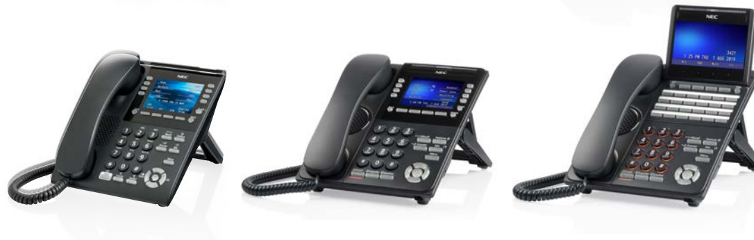
Color: Easy call control from the office, remote or home-based working, hot-desking