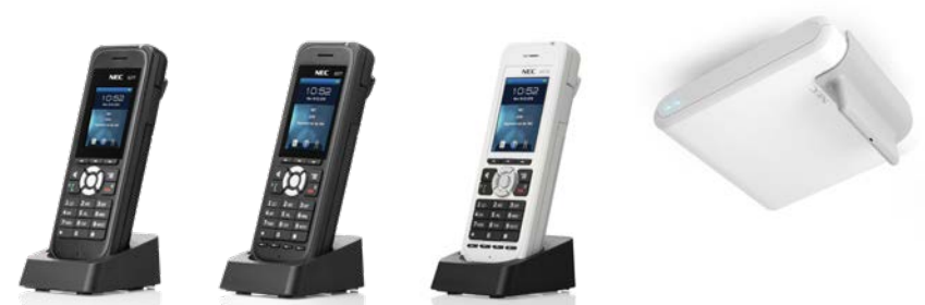
DECT handsets: for any working environment