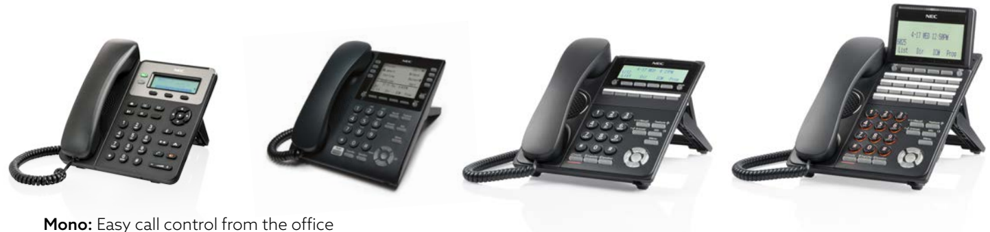
Mono: Easy call control from the office