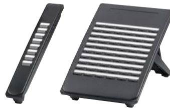
8-line Key Module / 60-line DSS Console