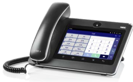
GT890: IP Desktop Video Telephone